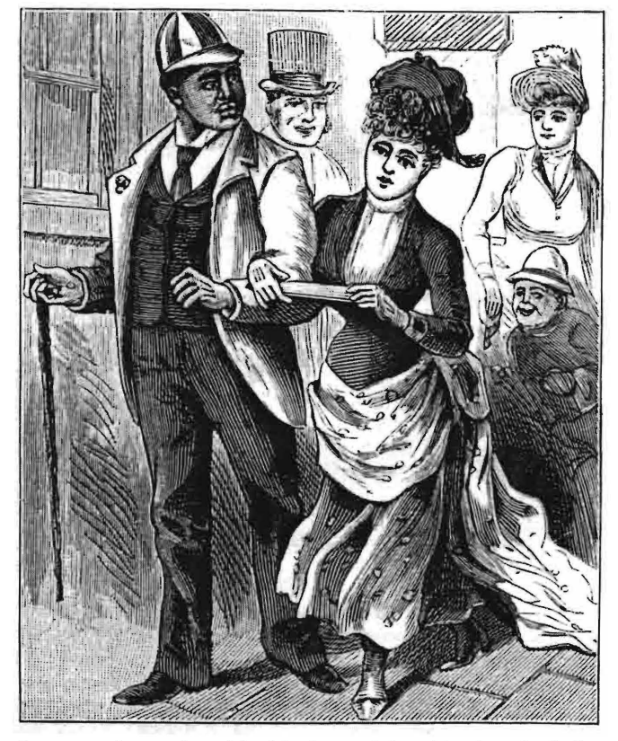
So unusual was the white-black match in 1889 that the Police Gazette noted, "A pretty white girl of Xenia, Ohio, marries a hunk of charcoal and parades the streets with him." The couple was arrested.

about the Negro's plight than Aristotle did. Today, blondes of both sexes, being more or less Nordic and consequently gifted with more genes for altruism than members of any other race, feel more guilty than any other racial group for the sins of that peculiar institution. Put the two together -guilt and altruism -- and you have the contemporary recipe for the kind of racial mixing we are talking about.